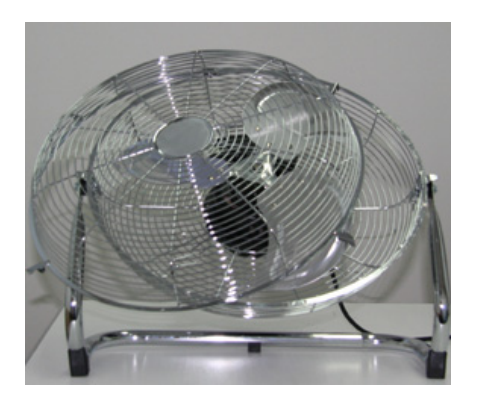
3. Remove the front grid and clean by a vacuum cleaner.