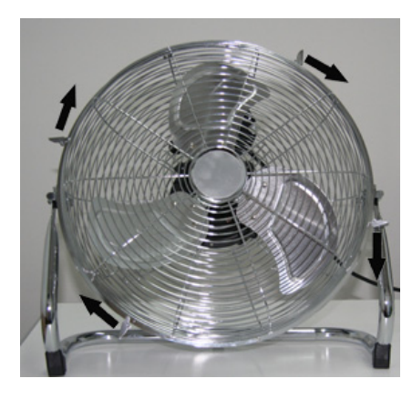
1. Open the 4 hooks as shown by the arrows.

Clean the fan inside frequently, based on the environmental conditions: a dirty fan may prevent the fan from working properly.