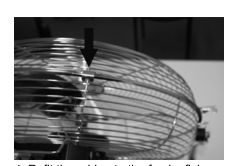
Refit the grid onto the fan by fixing firmly the upper hook to the bars of the grid as shown by the arrow.