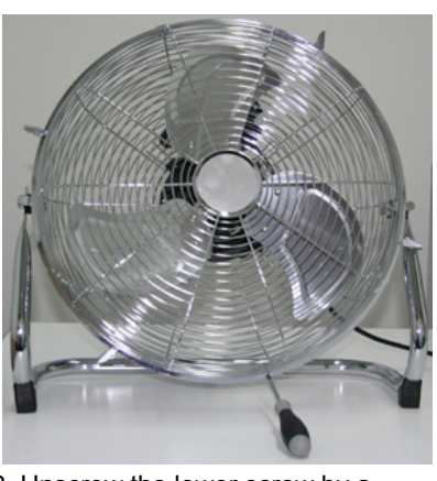
2. Unscrew the lower screw by a screwdriver.