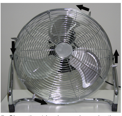
5. Close the 4 hooks as shown by the arrows.